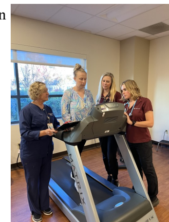
Staff and nurses work one-on-one with patients to ensure they are safe and recovering well.