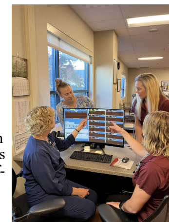
The Cardiac Rehab team reevaluate patient vital signs during rehab classes.

Together, let us rally to support local patients who need the Cardiac Rehabilitation Program. To give to this important program please use the enclosed gift envelope or donate online at www.SupportSierraNevada.org/Donate .