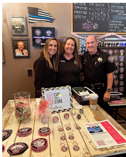
Local law enforcement came together for another successful year of the Pink Patch Project. Officers pictured here are at the annual Coffee for a Cure event at Sierra Mountain Coffee Roasters promoting the Pink Patches and coins.