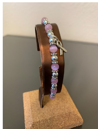
Pink awareness bracelet are back! Volunteers made 100 pink bracelets that are sold for $30 at SNMH Foundation, the Cancer Center, and Hospital Gift Shop. All proceeds support Cancer Center Support Groups at SNMH.