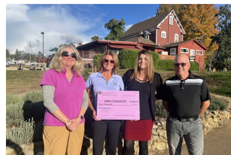
The Nevada County Country Club hosted their annual October tournament with proceeds benefiting the support groups at the Cancer Center. This year the club raised $4,000 to help keep the many support groups up and running to benefit patients and their families.