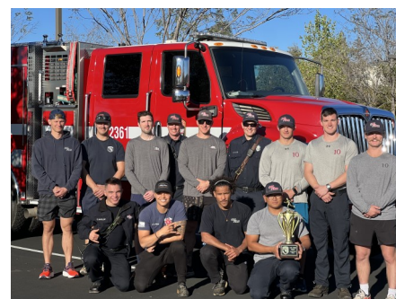
Local CALFIRE stations rallied together with the 40x40 running relay that ended at the hospital on October 28th. Their efforts raised over $1,800 for the Barbara Schmidt Millar Fund that provides free mammograms and breast health care to our community.