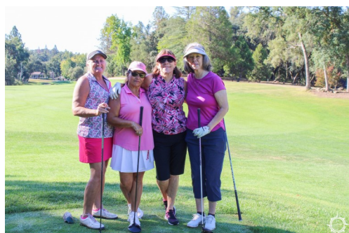
The Lake Wildwood Golf Clubs raised $13,000 with their Swing for the Cure tournament in October. The funds raised from this tournament will benefit our Comfort Cuisine Program providing healthy meals for our cancer patients and their caregivers. The program makes about 900 meals a year.