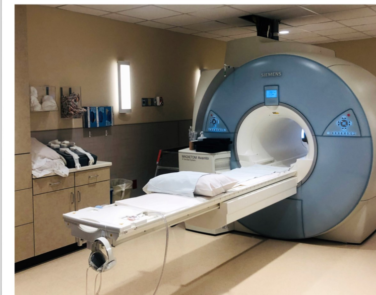
The new MRI machine.

In addition, the CT (computed tomography) machine will be moved closer to the ER to ensure immediate stroke treatment and care. The addition of an in-house MRI (magnetic resonance imaging) machine and other diagnostic imaging equipment will allow patients to stay in the same building for testing, decrease overall wait time, and greatly reduce patients needing to leave the community for care.