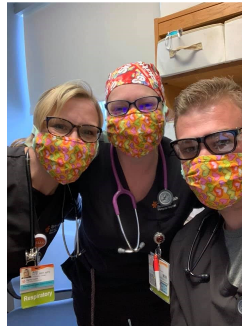
SNMH Respiratory Department with their donated, homemade masks.

On behalf of Sierra Nevada Memorial Hospital Foundation and Sierra Nevada Memorial Hospital, we would like to thank community members for their generous donations of beautifully made masks during this challenging time of COVID-19. We want you to know it has deeply touched the employees at the hospital to know you are helping us.