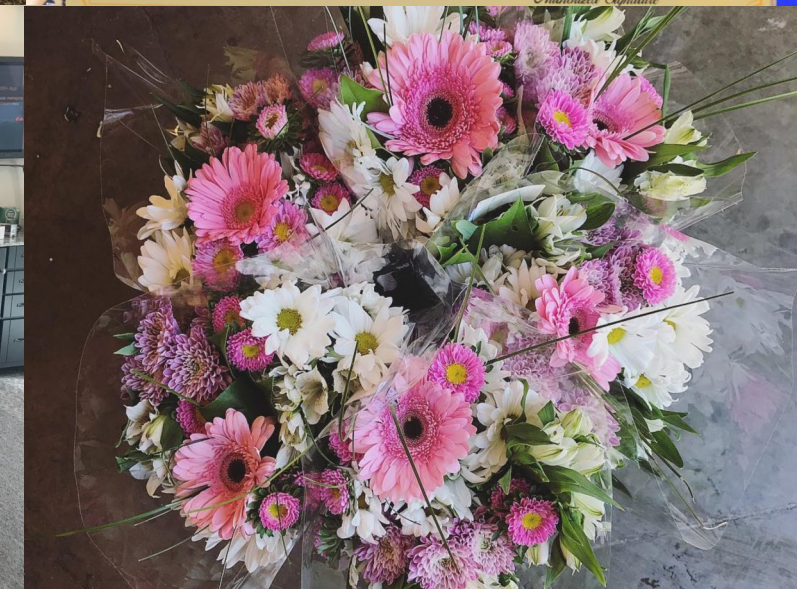
BriarPatch Food Co-Op pink bouquets for Breast Cancer