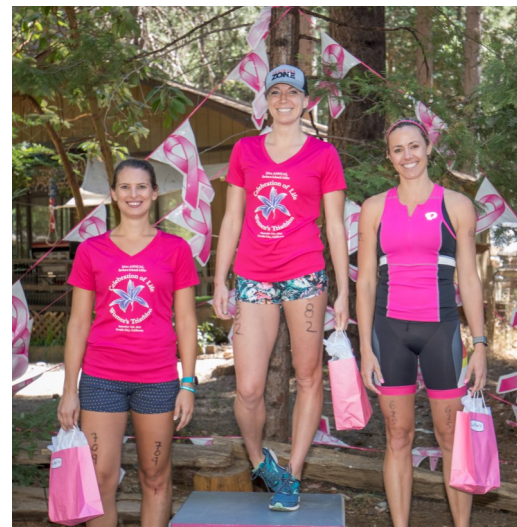
Winners of the BSM Celebration of Life Triathlon.

For more information on the Barbara Schmidt Millar Celebration of Life Triathlon, please visit www.bsmtri.com or call Sierra Nevada Memorial Hospital Foundation at (530) 477-9700.