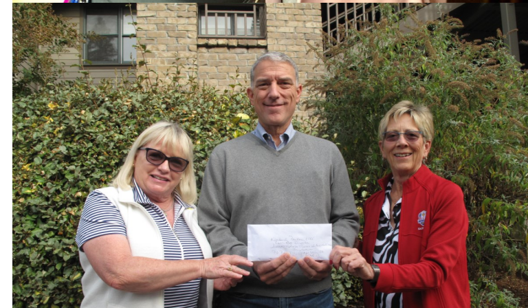
Alta Sierra Women's Golf Club "The Witch Is In" Halloween golf tournament for Breast Cancer.