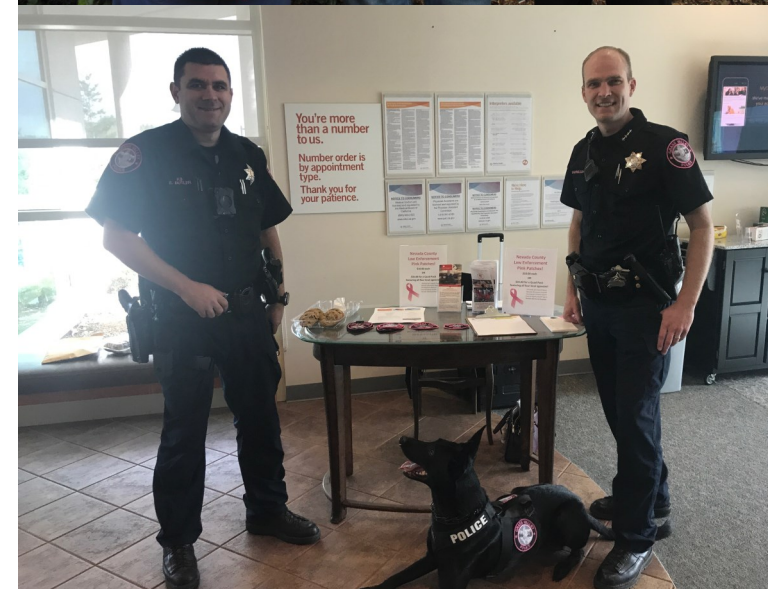
NCPD, GVPD, NCSO and CHP Pink Patches for Breast Cancer