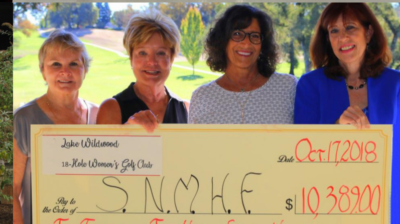
Lake Wildwood Golf Community "Swing for the Cure" golf tournament for the new Infusion Center at SNMH.