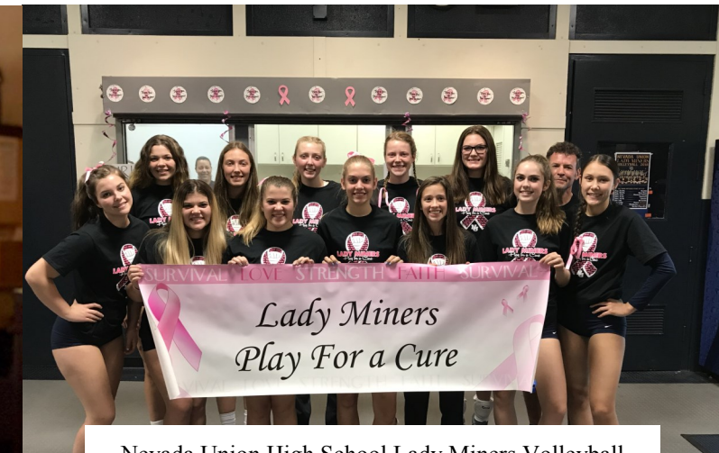
Nevada Union High School Lady Miners Volleyball Pink Night for Breast Cancer.