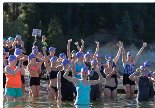
BSM Triathletes warm up before the swim portion of the race.