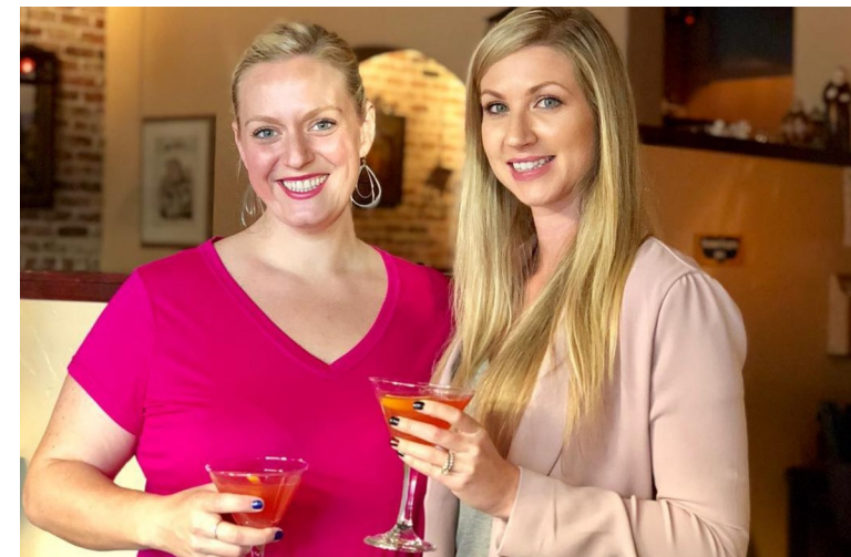
Tatatini drinks for Breast Cancer at Friar Tuck's Restaurant.