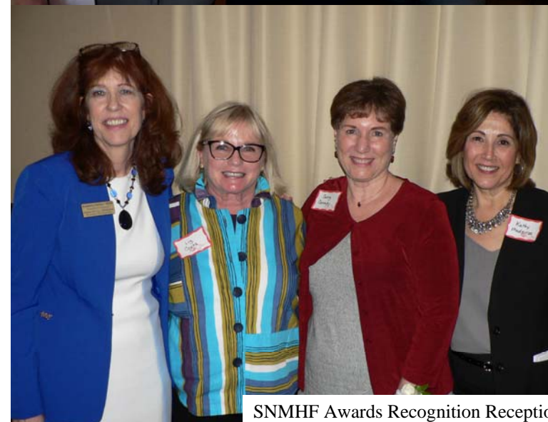
SNMHF Awards Recognition Reception