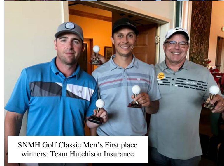
SNMH Golf Classic Men's First place winners: Team Hutchison Insurance