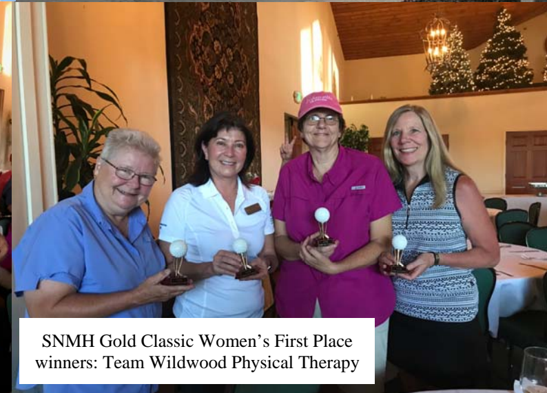
SNMH Gold Classic Women's First Place winners: Team Wildwood Physical Therapy