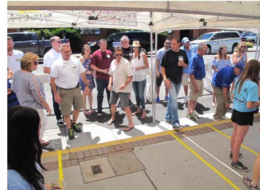
The 2018 John Kane Penny Pitch raised money for SNMH Foundation's Emergency Department renovation campaign

Themed house parties Shred-a-thon E-waste collection Golf tournaments Pickle ball tournament Product events (e.g. Stella Dot, Tupperware, etc.) John Kane Penny Pitch Paint the Town Pink Fashion Shows Car Shows Nevada Union Girls Volleyball Pink Night Bear River Football team fundraiser Paint and pour parties Hair salon fundraisers Spaghetti dinners Breast cancer and cancer fundraisers Silent auction at your business And much, much more!!!!