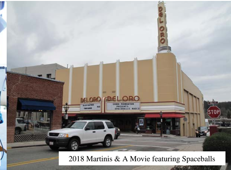
2018 Martinis & A Movie featuring Spaceballs