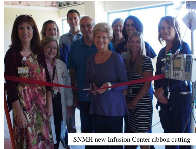
SNMH new Infusion Center ribbon cutting