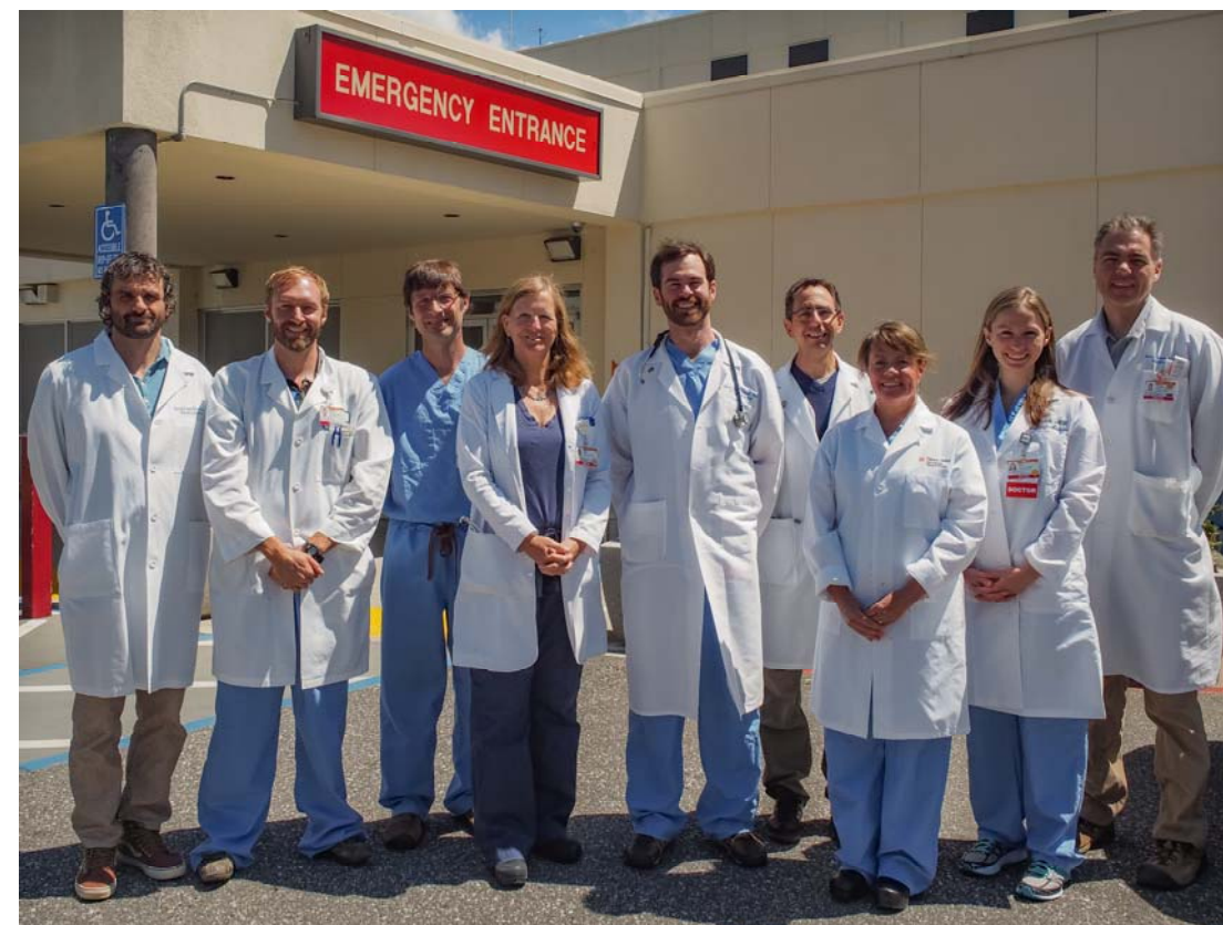
Eight of fourteen Sierra Nevada Memorial Hospital Emergency Department Physicians

When it comes to an emergency, every moment counts. Some people say the Emergency Department is the true front door of a hospital. This year, over 35,000 patients, plus their families and caregivers, will come through our “front door.” A door originally built to accommodate 15,000 patients.