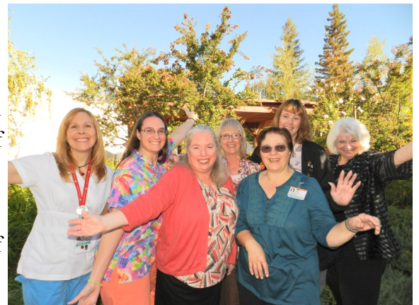
The Share the Spirit Committee at SNMH is comprised of Hospital employees from various departments.