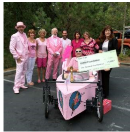
Team Ta Ta raising funds with their pink soap box.