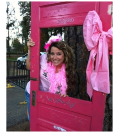
The Pink Boulders encouraged donations with their pink door.