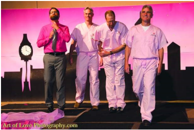
SNMH Physicians at Paint the Town Pink. The Union's 9th annual event raised $10,000 this year.

October is national breast cancer awareness month with many local community events to support breast cancer care at SNMH. Each year our community rallies together, and this quarter over $40,000 was raised for Breast Cancer care at SNMH. Thank you to everyone who participated! Funds raised will help purchase new surgical equipment for breast cancer patients, the start of a new Integrative Medicine program, and other Cancer Center support groups.