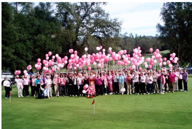
The LWW Lady Golfers raised $6,600 through their October golf tournament.