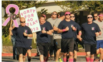
The 40 for 40 relay marks it's third year including many more firefighters.